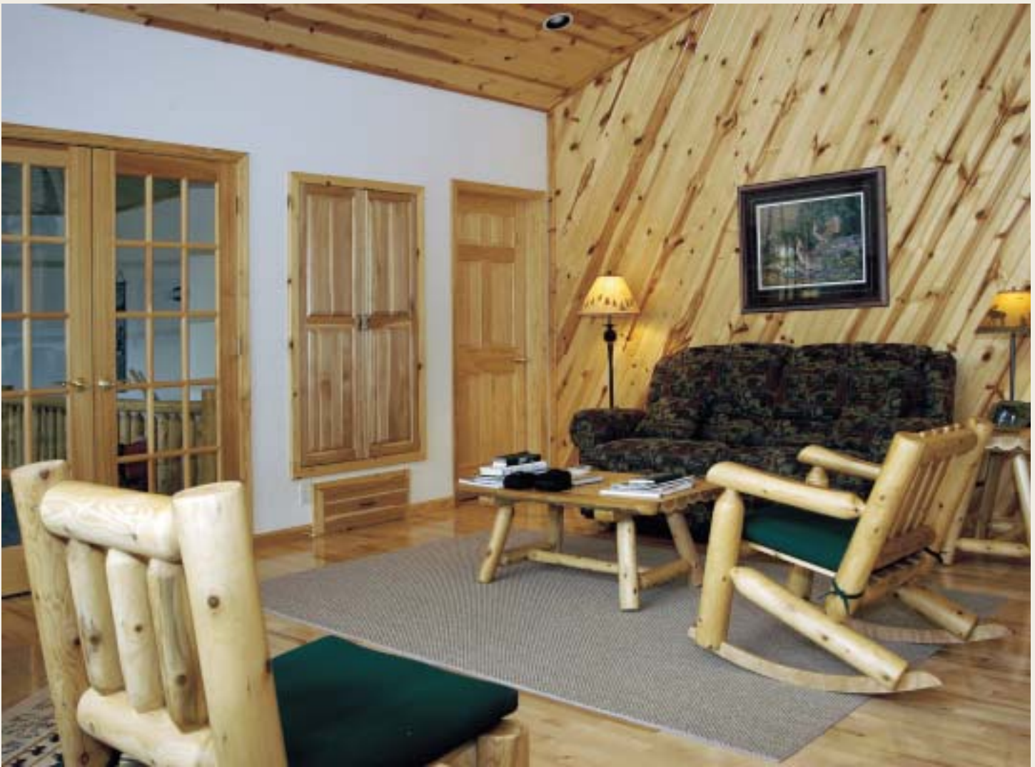
How about a nice quiet morning with a warm cup of coffee and a view of nature outside in your yard.

“The people that represent Energy Star are a great source of information. They can teach you so much if you just listen. They show us how to build better homes and make them safer for our families. I like things that challenge me to be a better builder, and Energy Star does that.”