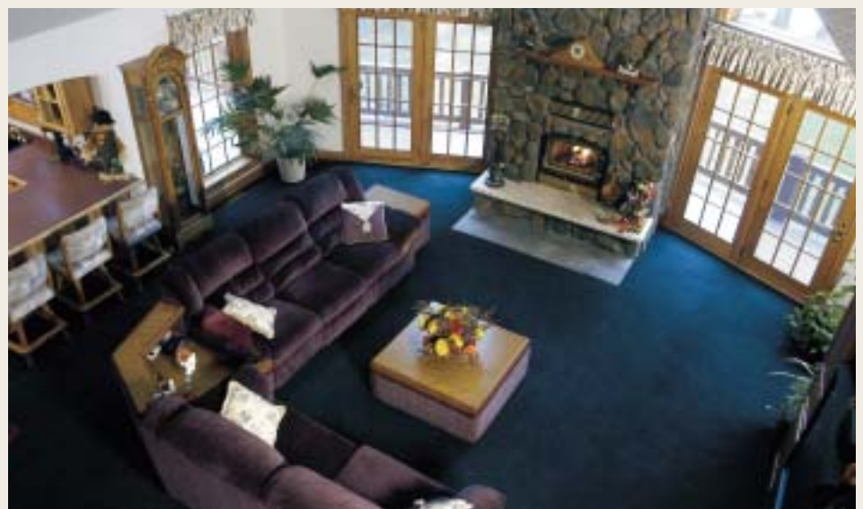
Space is very important when you are building your primary home or a home away from home. This great room features a two story cathedral ceiling, a hand crafted stone fireplace that’s energy efficient, and a wonderful view overlooking a lake.

because he wanted his own home to be energy efficient. “The Energy Star program is fantastic,” he says.