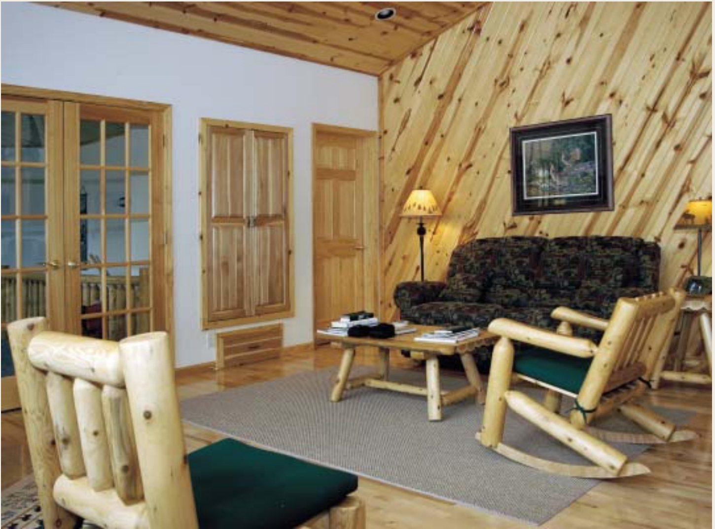
How about a nice quiet morning with a warm cup of coffee and a view of nature outside in your yard.

“The people that represent Energy Star are a great source of information. They can teach you so much if you just listen. They show us how to build better homes and make them safer for our families. I like things that challenge me to be a better builder, and Energy Star does that.”