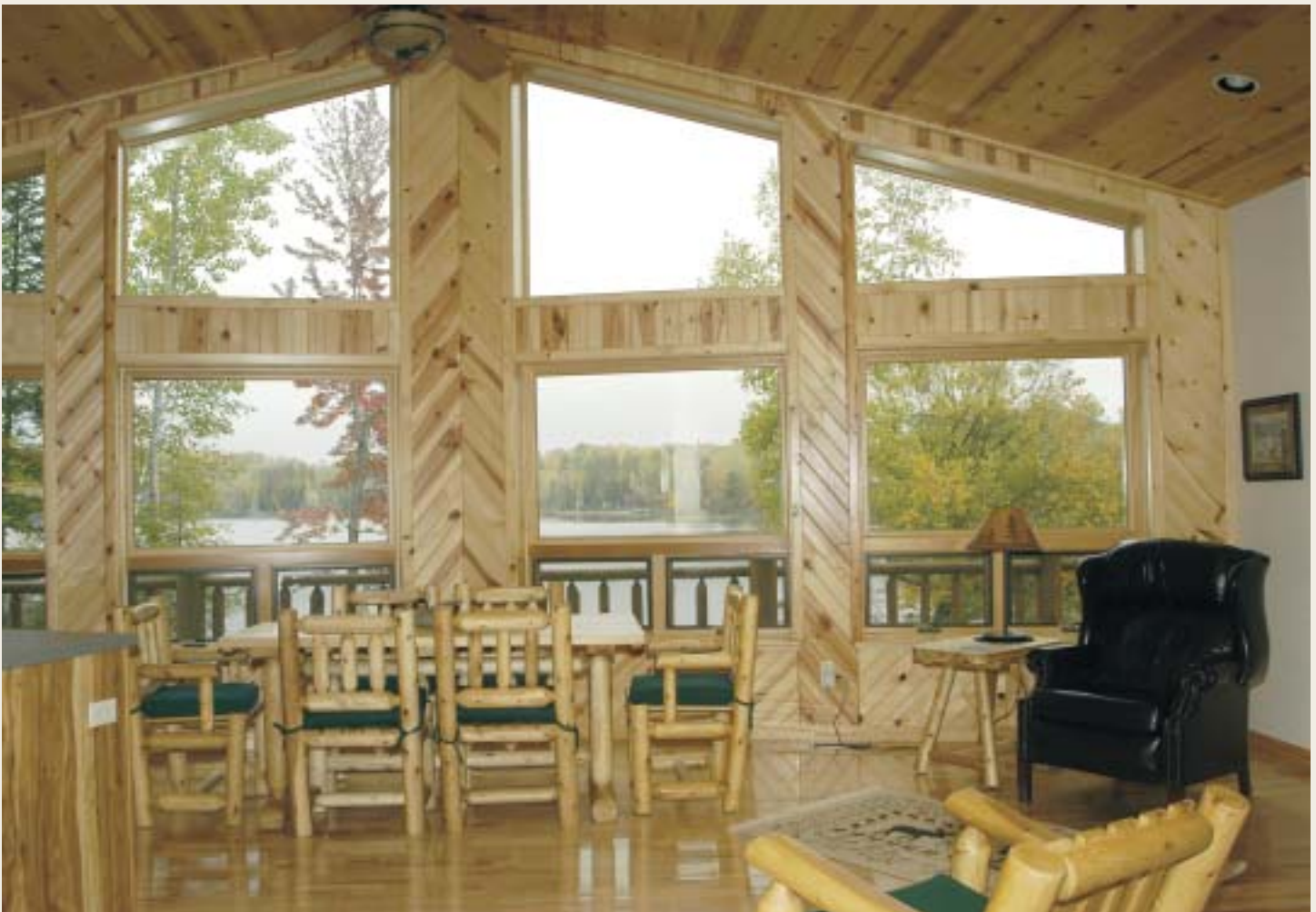
Everyone's tastes are different. It is however hard to argue with this being a great view to start and end your day with!