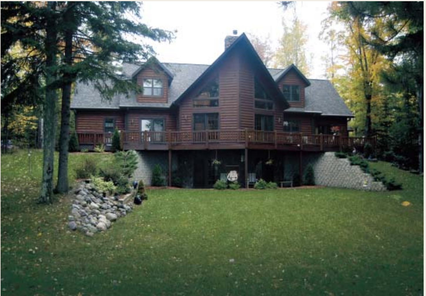
This log sided home is surrounded by beautiful north woods plus it overlooks a gorgeous lake, fishing anyone?