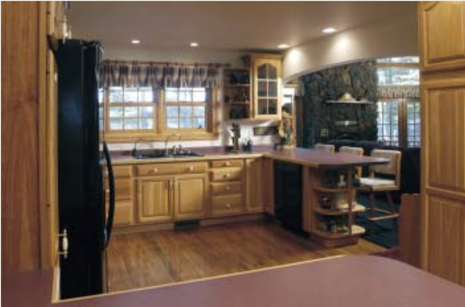
Kitchens are a great entertaining hub. This one is no exception; with access to the great room, it's perfect for creating a meal or some snacks after hiking or biking.

The second home, a 4 bedroom 2 bath also on a lake, it's completely constructed using ICFs. The exterior