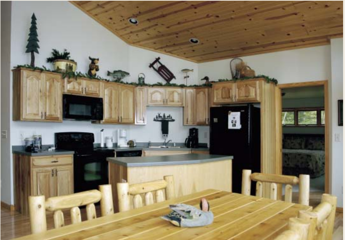
This rustic kitchen features hickory cabinetry with matching black appliances while overlooking a breathtaking view of the lake.